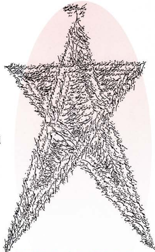
A Tablet written by the Báb in the form of a five-pointed star. This is a symbol of the Bahá'í Faith. The nine-pointed star is also used as a Bahá'í symbol.

Calligraphers often use a special pen with a broad, flat edge, which creates thick and thin lines. If you don't have a calligraphy pen, you can use any pen or pencil.