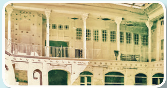
Bahá'u'lláh lived in this house during much of His time in Baghdád. It's a sacred place to Bahá'ís. It was confiscated in the 1900s and illegally destroyed in 2013.